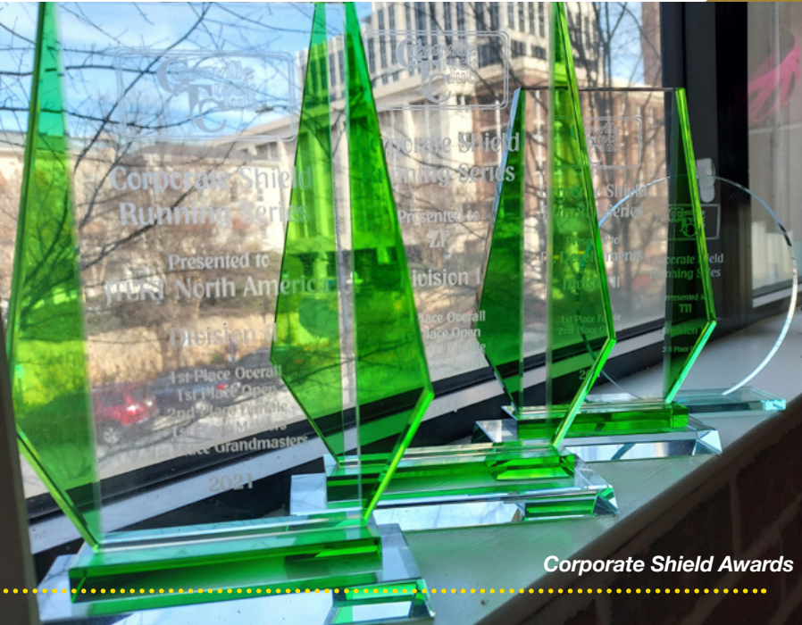
Corporate Shield Awards